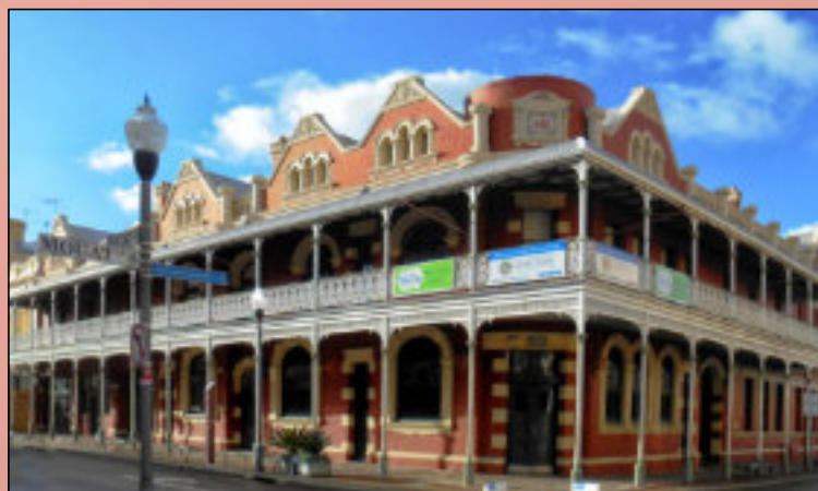
Part of Notre Dame University, Fremantle

Our bus trips are brought to you by volunteer organisers, drivers and hosts. Buses depart on time from East Fremantle Community Park carpark, corner of Marmion and Moss streets. Return times are approximate. Unfortunately we are not able to accommodate walking frames or other mobility devices so those attending need to be reasonably fit and able to look after themselves. If you can't make it please let us know beforehand on 9339 3964, or on the day use the contact number of your Glyde-In host (contact details in your reminder email, sent the week prior).