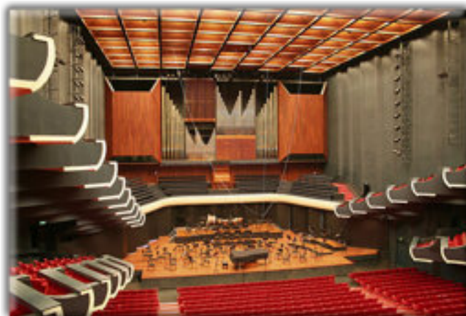
The choir stall seats in the Perth Concert Hall are just below the organ and afford a superb view and excellent sound for an orchestral concert